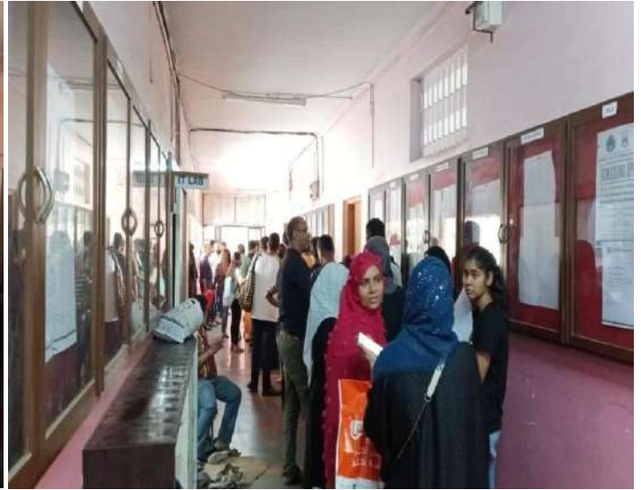
Boys and Girls Anti-ragging Squad Members Conselling Students during Admissions