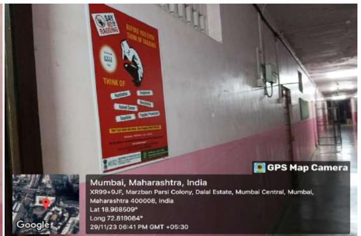
Anti Ragging Sinages in College Campus

Gilderlane Mun. School Bldg. Belasis Bridge, Opp. Rly. Stn. Mumbai Central, Mumbai 400 008 Tel.: 022-23082017-18, 022-23012671 Email: degreecollege@nesedu.in Website: www.nesedu.in