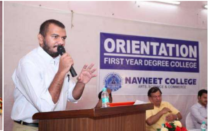
IQAC Co-ordinator Orienting Students about IQAC and Various Statutory Committees and their Roles