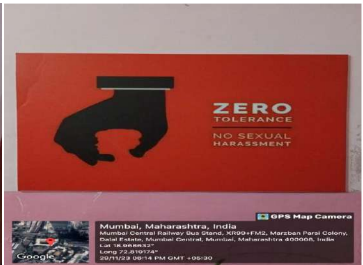
Zero Tolernace Sinages in the College Campus