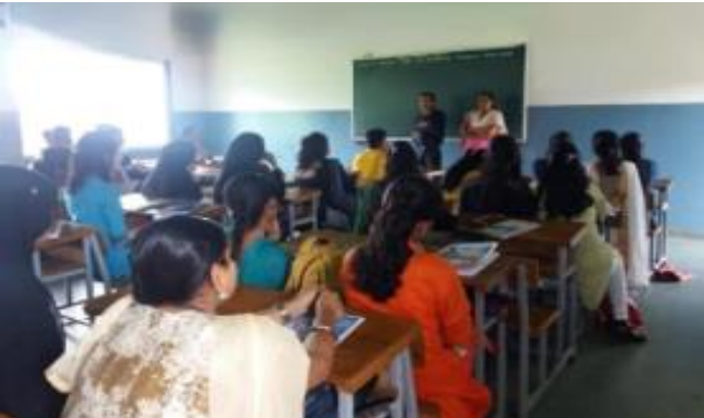
2) Zero Waste Campus Programme (Date: 13 December 2021)