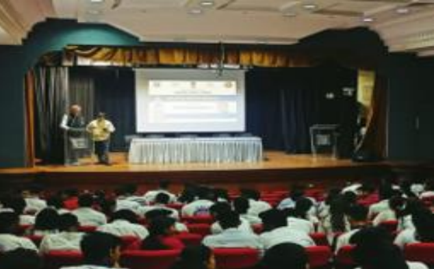
3) Paper Conservation Activity (Date: 16th February 2022)